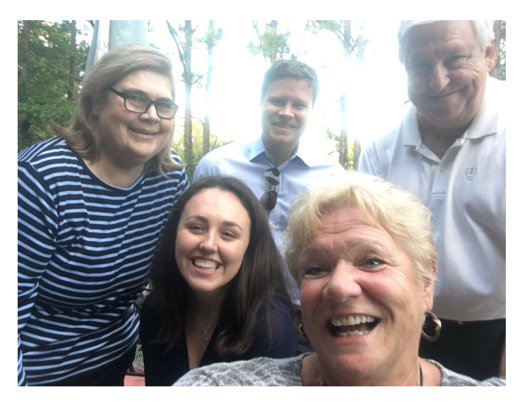
RECAP ON RECENT ROTARY EVENTS October 15, 2016 NFServes

Members of the Rotary Club of Sandy Springs and the North Atlanta Rotaract Club participated during Saturday, October 15, 2016's NFServes (North Fulton Serves). Locations were Lake Forest Elementary School and the Sandy Springs Library.