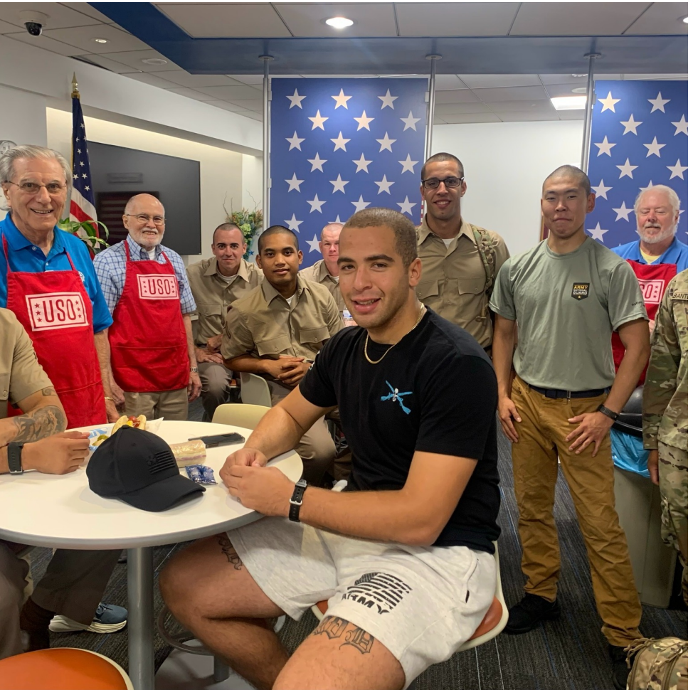
We will serve our service personnel and family members an "All American" lunch of hot dogs with all the condiments, potato chips, fresh fruit, snack bars, home baked cookies bottled water plus a portion of baked Ziti & Mom's meatballs.