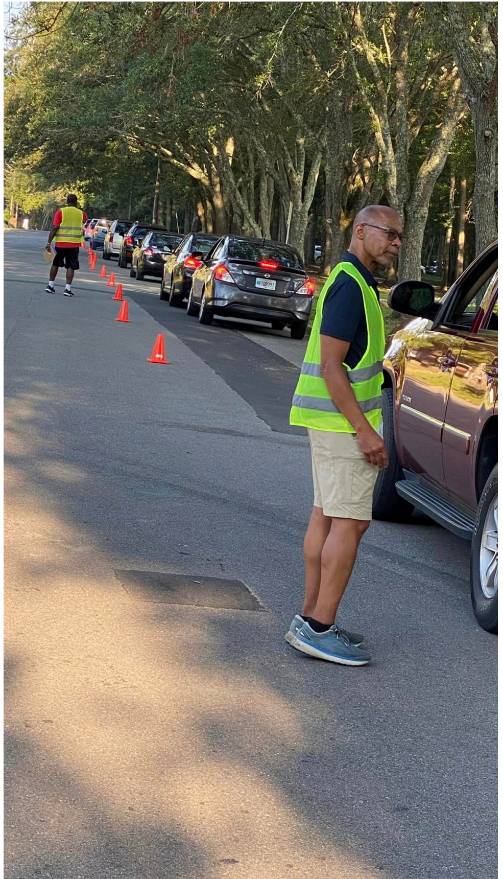
Each household received a variety of fresh and frozen foods, including collards, zucchini, sweet potatoes, blueberries, peaches, oranges, strawberries, and chicken.